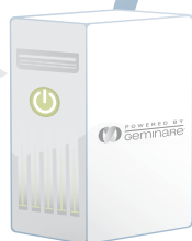
Replicated Server at Geminare